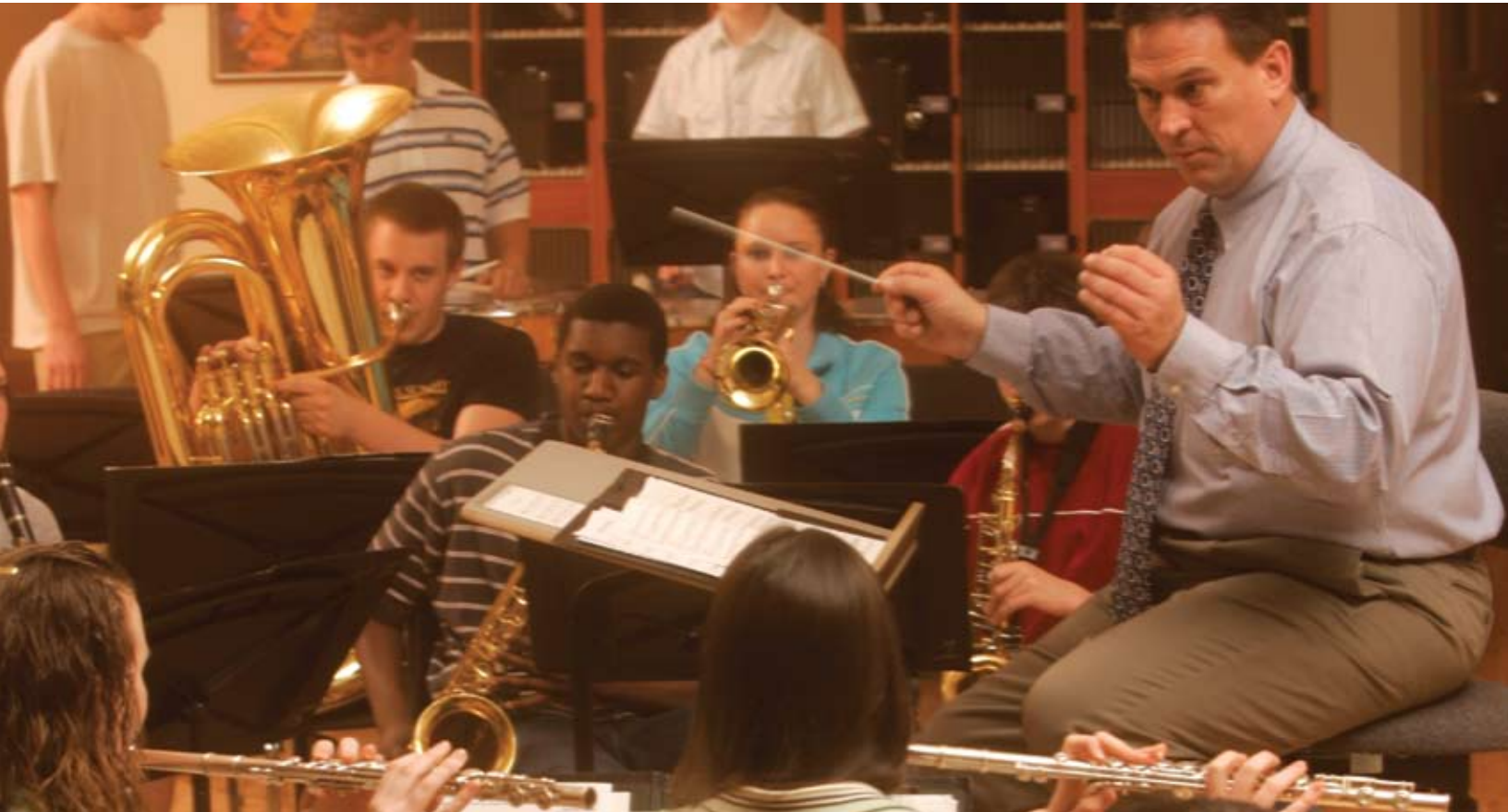
MUSIC REHEARSAL ROOM EQUIPMENT