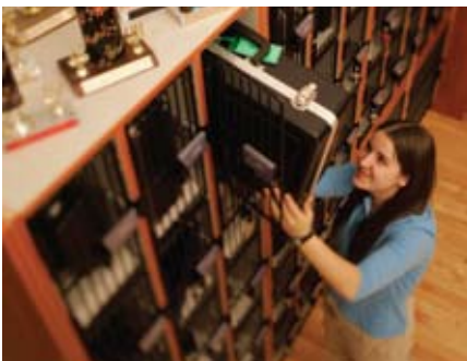
INSTRUMENT STORAGE CABINETS